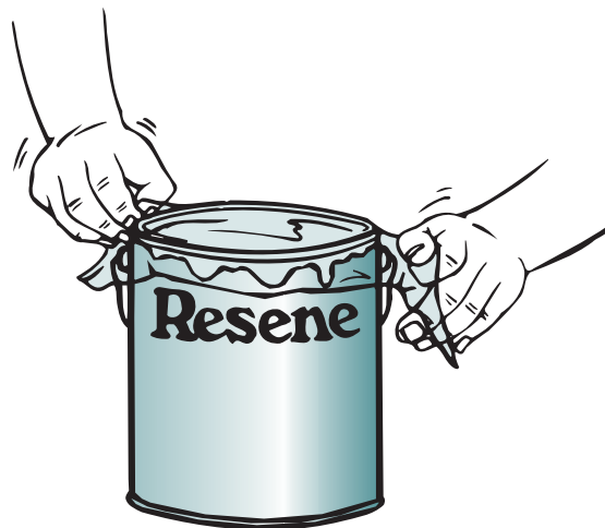
Seal the can with cling film to stop a skin forming