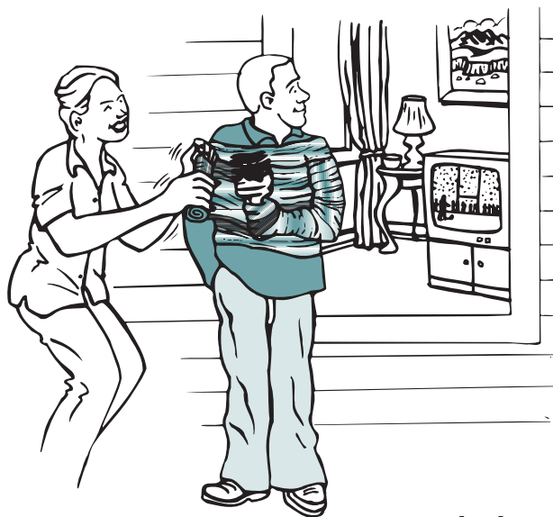
Wrap the brush between painting sessions

Resene paint labels carry full instructions on surface preparation and advice on paint application. Please read these instructions carefully before commencing work. Always stir the paint thoroughly before use. Contact your local Resene ColorShop or Reseller if you need further advice.