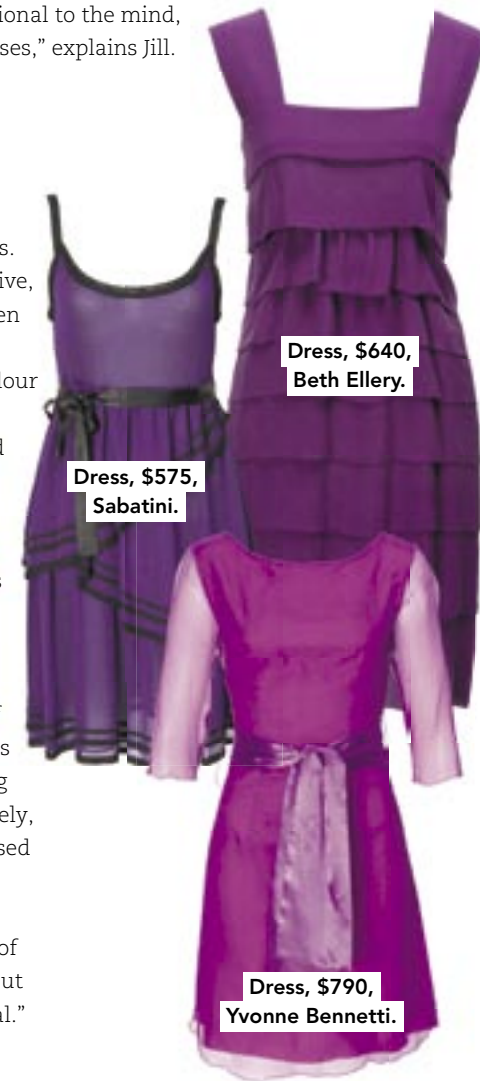
Dress, $640, Beth Ellery.

According to Thelma, if you wear purple you're feeling inspired and sensitive. If you favour this colour you're likely to be creative and artistic, in touch with your spirituality and intuition and interested in New Age principles such as spiritual healing. "Wearing purple projects confidence and individuality so it's a wonderful colour if you're in a leadership role or a host at a party," says Ingrid. "The best colours to accessorise with purple and violet tones are blue, turquoise, cherry pinks and white." ■